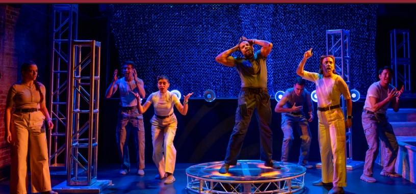
The Desire of The Astronaut 2024 Cast.